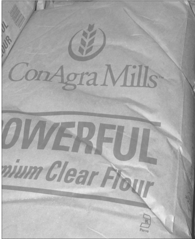
The new Con Agra yoshon flour, "KOF-K"-certified.

Now the system is completely different. Workers still lift the bags but they carry them from where they are being stored, cut them open and dump the flour into a storage tank (silo), just a few feet from where the sacks were stored. When the baker wants to send flour upstairs, the system is turned on and the flour travels by pneumatic pressure through the pipe to a sifter. That sifter has a nylon sifting screen of 50 mesh — that is, fifty holes to the linear inch, fine enough to catch all the insects present, as well as plenty of foreign matter that is in our flour. (A square inch will have 2,500 holes.)